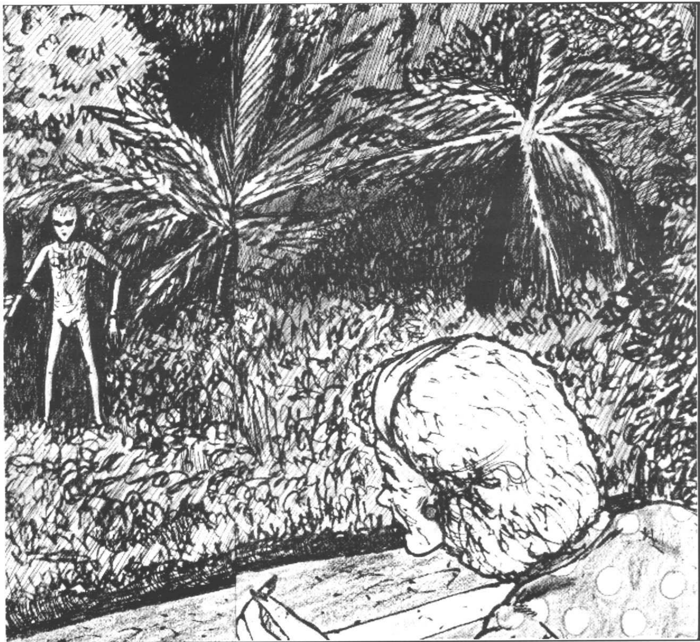
Señora Rivera sees the little man.

Rio Grande, had had in January 1989 - and also connected with El Yunque.